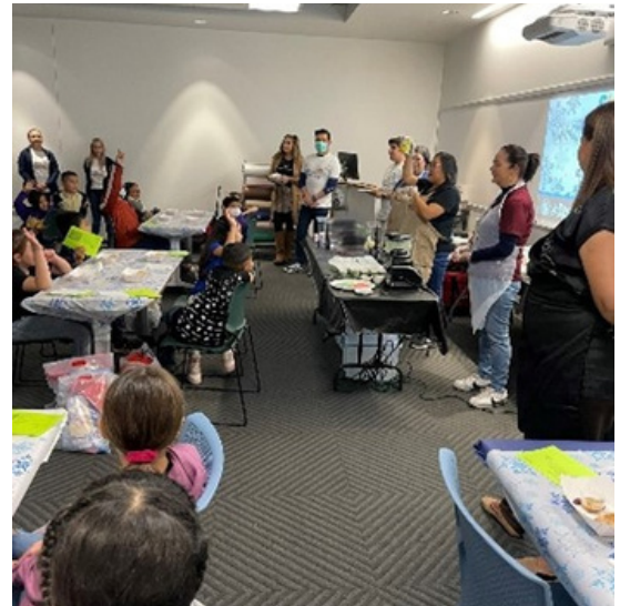
EFNEP educators provide a cooking demonstration to elementary students at wellness event.

As part of EFNEP's commitment to providing nutrition education to families and youth with limited resources, we continue to partner with the various school districts and community organizations throughout El Paso County. These students participate in a series of fun and educational lessons on good nutrition and food safety as part of summer programs, classroom, and after-school activities. Through fun and engaging activities, youth learn to: build a healthy plate, set limits on sugar, fats, and sodium, be active, food safety, and practice healthy behaviors.