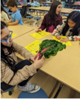
Students from AV Cato Elementary's after-school Garden and Cooking Club, tasting Swiss Chard.