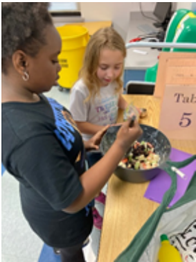
Students from Holiday Heights Elementary School ASPIRE program mixing our first recipe, Cinnamon Carrot Crunch.

With area schools being out for summer, I'm taking time to reflect on seven after school-programs that participated in Learn, Grow, Eat and Go! (LGEG) What a great experience for me to visit with the students and teachers and hear their joy and excitement after participating in this 10-week program. They loved trying new foods, learning new recipes, learning about nutrition, and sharing all that information with their friends and families.