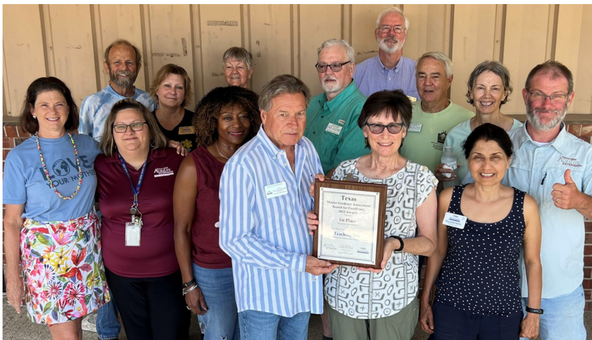
Members of the VGEF project design team pose with a representative of the Texas Master Gardener Association with their 1st place award plaque

The Volunteer Spotlight for this quarter is on Fort Bend County!