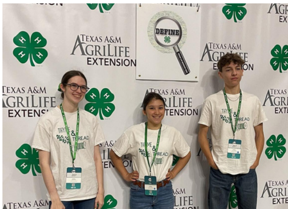
The Thyme and Thread team pulled double duty at 4-H Round Up participating in both the Food Challenge and Duds to Dazzle Contests. They like to say that anything can be made better with a dash of thyme and a length of thread.

These 4-H members made memories that will last a lifetime, and cemented public speaking and critical thinking skills that will serve them well.