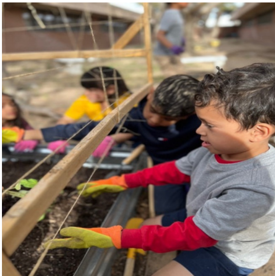
Sunrise Elementary students planting tomato seedlings in their garden beds.

Talking about how healthy eating and gardening keeps making an impact on little ones, the curriculum Early Childhood Learn, Grow, Eat and Go! [EC LGEG], has been implemented in Head Start centers throughout El Paso County. The series was developed for three to five year-olds, providing exposure to healthy eating habits, learning about plants and gardening, and fun physical activity games. A total of 260 students have graduated from EC LGEG since the curriculum was released last year, and several centers are now waiting to start a collaboration in the upcoming school year. Teachers and students are delighted by the fun learning experience, and kids are learning that vegetables don't come from the grocery stores but rather provided by Earth!