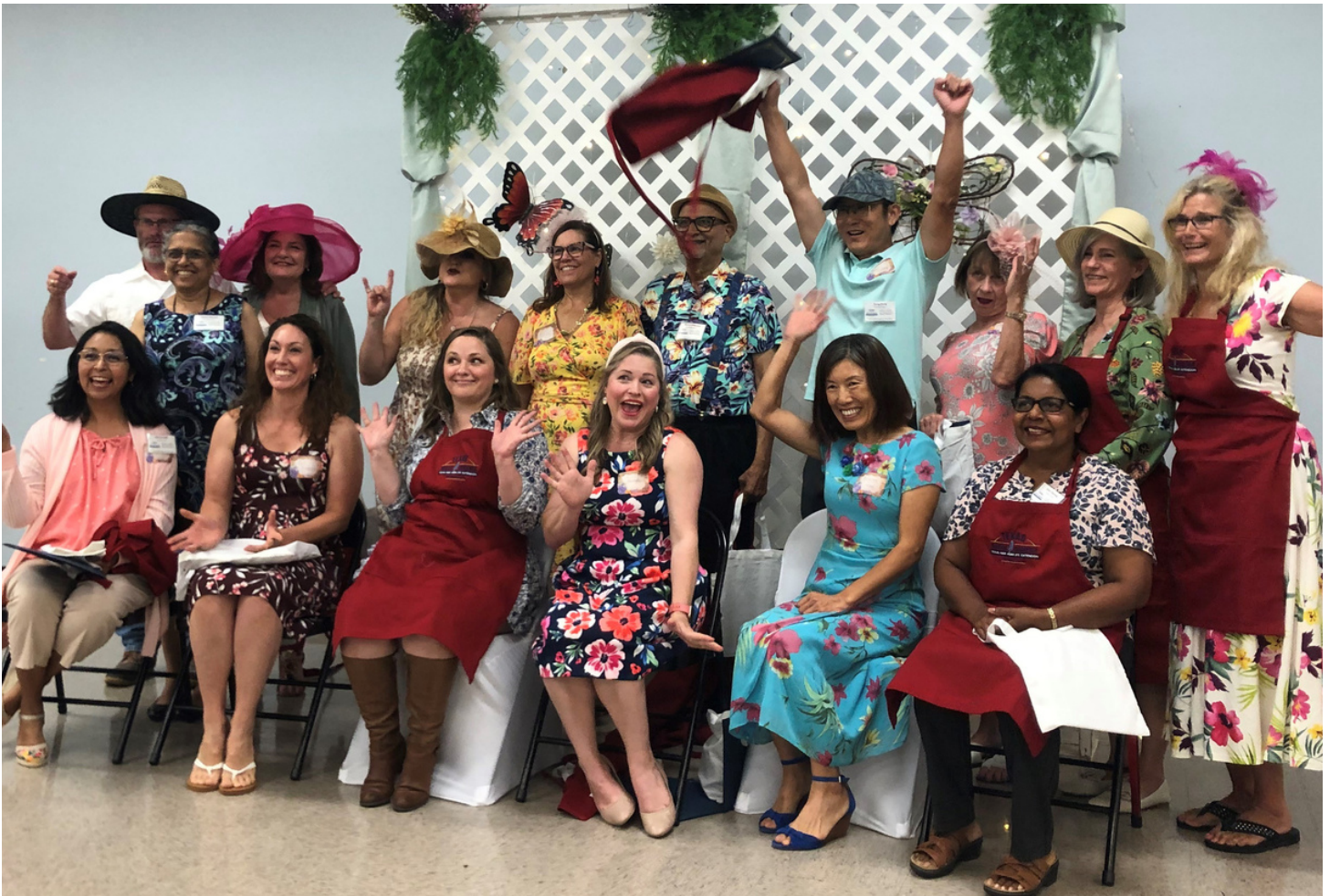
Graduates of the Fort Bend County Master Gardener Intern class celebrate with a "Garden Party"

To remain a Certified Master Gardener members must maintain their certification through annual volunteer hours of 24, and annual continuing education of 12 hours. The Extension service helps through educational programming and volunteer opportunities, as well as approving other outside educational events. Nineteen new members of the Fall 2022 class were celebrated for the completion of their requirements on June 6.