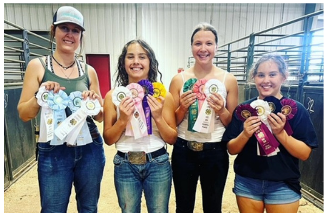
These kids are not just horsing around! Whether it's horse judging or horse shows, they show off their skills and bring home accolades for Fort Bend County!