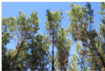
Texas timber fuels the economy

By Julie Tomascik The tall, tall trees in East Texas