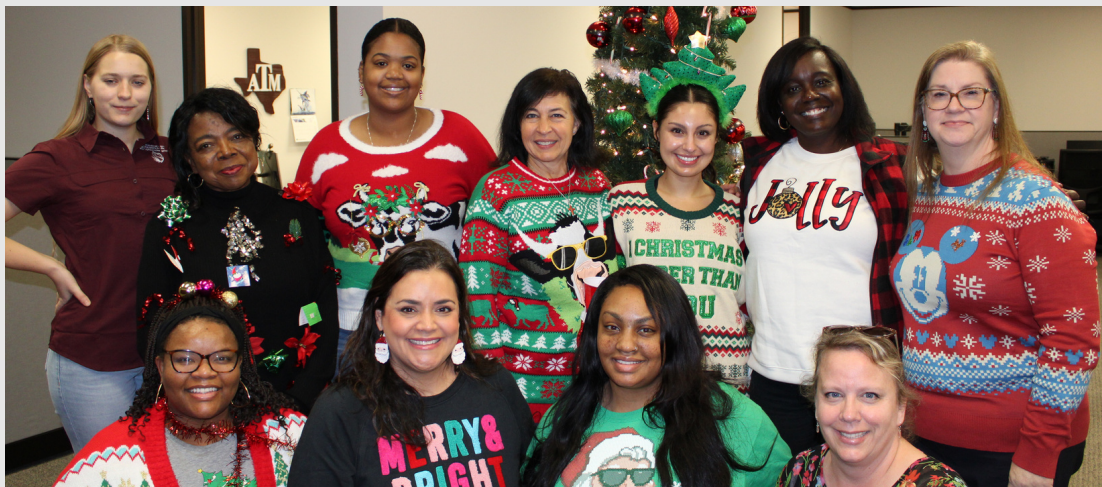
PHOTO ABOVE: TEXAS A&M AGRILIFE EXTENSION SERVICE - HARRIS COUNTY OFFICE STAFF