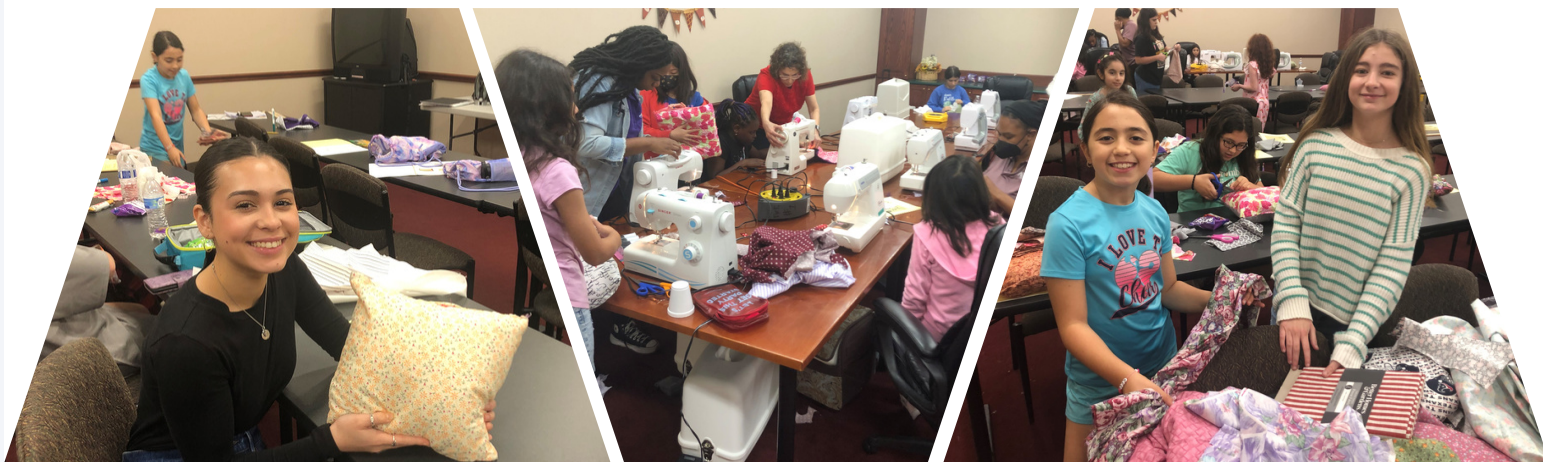
Having fun while learning to sew, these young people acquired new skills

Fort Bend County youth participated in a 4-hour Sewing "Mini-Camp" during a school break on November 20, where 20 participants learned basic sewing skills by making decorative pillows.