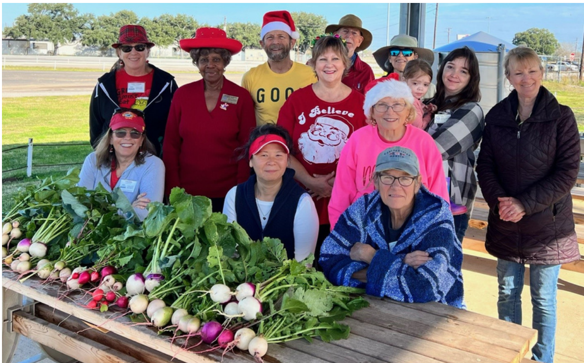
The Fort Bend County Master Gardener Association Vegetable Team is pictured above with the last donation of 2023 to the Mamie George Community Center to share with area residents in need.

The Fort Bend County Master Gardener Association is dedicated to education and outreach. Produce harvested from demonstration gardens is donated to local food pantries . The Association set a goal to grow and donate 2000 lbs. of fresh vegetables in 2023.