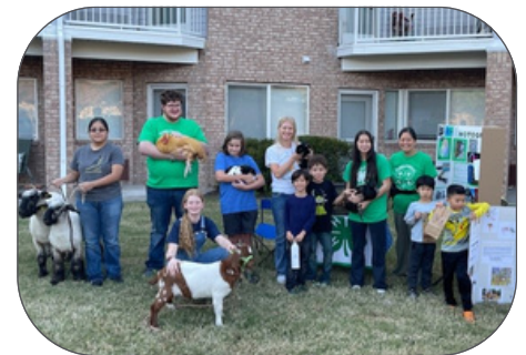
Tumbleweeds 4-H petting zoo at El Dorado retirement home