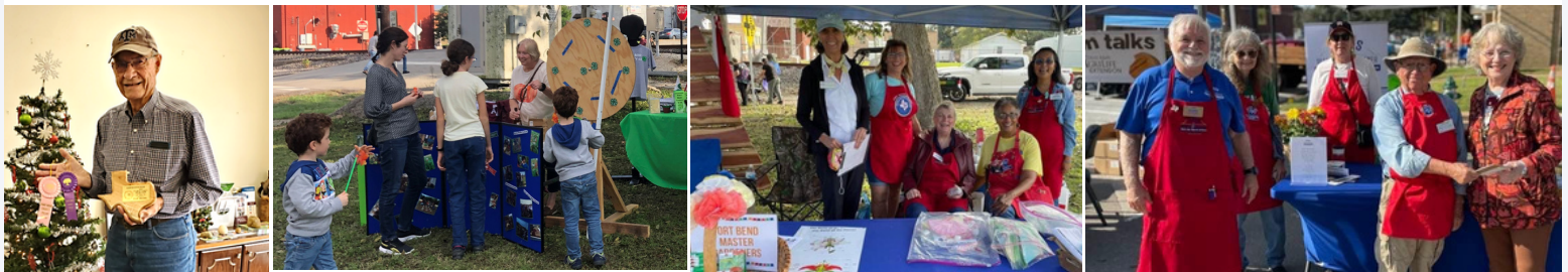
L to R: A winner from the Pecan Show, Kids Activity area with 4-H, Volunteers leading youth activities, Volunteers providing pecan education

The Pecan Harvest Festival was held in downtown Richmond on November 18th. Fort Bend County Extension Agents and Master Gardeners hosted the Pecan Education area of the festival utilizing the Farm Bureau Education Trailer. Experts were on hand to answer questions about growing, harvesting, and eating pecans. The 26 samples entered in the Nov. 8th Pecan Show were on display. Also, 4-H & Youth Development Agents and the Master Gardener Youth Activities Committee hosted the Kids Activities area of the festival with a variety of interactive games and crafts. An estimated 5,000 people attended the event.