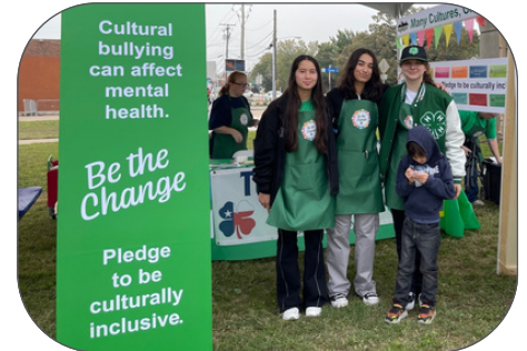
Tumbleweeds 4-H booth during the Core Festival

December was another active month for the club where they hosted a blanket drive, helped run a bake sale with East Dallas 4-H, and participated in the City of Richardson Christmas parade, with the theme "Parade of Misfit Toys," winning first place in the marching/ walking entry for non-profit/ civic group and collected 26+ toys for Network of Community ministries.