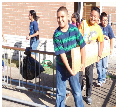
LGEG supports school gardens .

This is a perfect example of a wellness program that addresses a variety of interests and provides a lifelong wellness skillset...it is our hope that the students impacted by this program will continue to be wellness role models in the community." School District Wellness Personnel