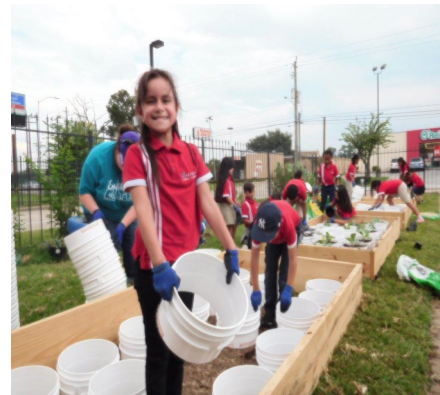
Great way to introduce gardening.

Educational programs of the Texas A&M AgriLife Extension Service are open to all people without regard to race, color, religion, sex, national origin, age, disability, genetic information or veteran status. The Texas A&M University System, The United States Department of Agriculture and the County Commissioners Courts of Texas Cooperating.