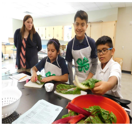
Youth learn to cook in the classroom .