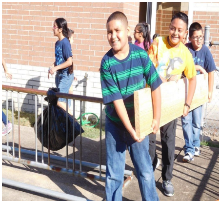
LGEG supports school gardens .

This is a perfect example of a wellness program that addresses a variety of interests and provides a lifelong wellness skillset...it is our hope that the students impacted by this program will continue to be wellness role models in the community." School District Wellness Personnel