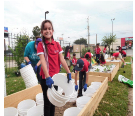
Great way to introduce gardening.

Educational programs of the Texas A&M AgriLife Extension Service are open to all people without regard to race, color, religion, sex, national origin, age, disability, genetic information or veteran status. The Texas A&M University System, The United States Department of Agriculture and the County Commissioners Courts of Texas Cooperating.