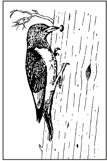
Figure 1. Woodpeckers are common throughout much of Texas, and are often found in urban and suburban areas.

from plywood, cardboard or construction paper, then painted black and hung from the eaves of the building near the damage site (see Fig. 2). Owl silhouettes or decoys and rubber snakes are, for the most part, ineffective.