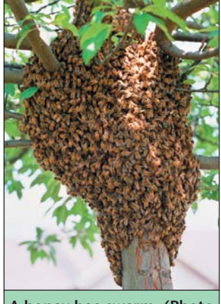
A honey bee swarm.

If a swarm lands in a remote site, it should be left alone. The swarm does not contain stored food or immature bees so the bees have nothing to defend and are unlikely to sting.