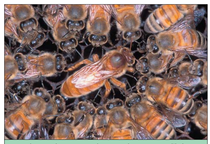
Honey bee workers surround a queen bee. Bees are likely to sting only when they perceive a threat to the nest and queen.