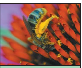
Bees are valuable pollinators and rarely sting when they are away from the nest searching for nectar.

Foraging bees. It is common to see honey bees foraging for food and water around homes and other structures. Foraging bees are away from the colony and are not likely to sting because they have nothing to defend. Bees visiting flowers and other food sources should be left undisturbed. To discourage