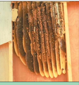
Bees can construct large wax nests rapidly once they enter a home. For this reason, both bees and nests should be removed as soon as possible.

easy to distinguish bees from wasps. Bees are generally hairy, with stout bodies and wide, flattened hind legs for carrying pollen ( see figure ). Wasps are generally smooth or have scattered hairs; they also have distinct "waists." Another way to tell the two types of insects apart is to find the nest or hive. Honey bee colonies build a wax comb in which to rear their young and store