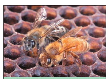
An Africanized honey bee (left) and a European honey bee on a honey comb. Despite color differences in these two individuals, the two strains cannot be distinguished visually.

Once away from the attack, remove the stingers as soon as possible. Stingers should be scraped out with a fingernail, knife or some other sharp object. Stingers continue to inject venom for many minutes after the initial sting. The sooner a stinger is removed, the less venom will be injected. If you