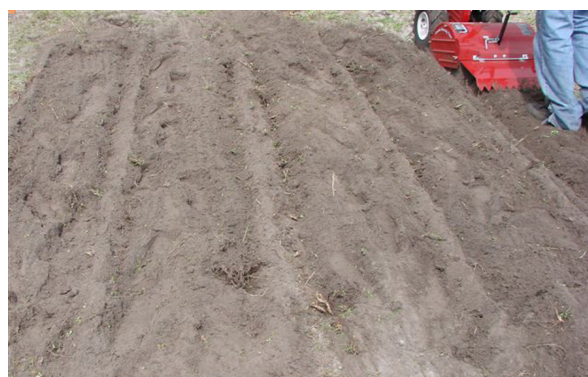
Figure 3. Shallow tillage using a roto-tiller can break up compaction that exists approximately 6 inches below the soil surface.

2. Shallow tillage with a rototiller or similar equipment is one of the most effective ways of breaking up surface compaction; however, it can only improve conditions in the top 6 inches of soil. Shallow tillage is usually done at a depth that will not damage buried utilities, but it should never be done around existing trees because of roots and cannot be used in existing turf (Figure 3).