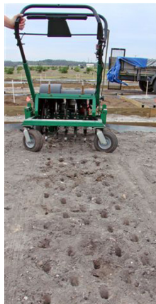
Figure 4. Plug aeration can be used to improve drainage in compacted soils with minimal effect on established plant roots or turfgrass.

3. Plug aeration is frequently used to reduce compaction and improve drainage and aeration in large turf areas, like golf courses and athletic fields. It is not as effective as shallow tillage, but offers a safe alternative in existing landscapes (Figure 4).